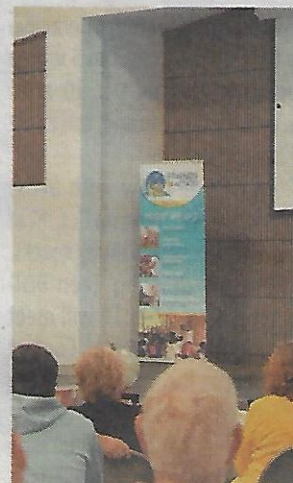
Attendees learn about FIA International's mission at a previous year's banquet. Attendees will have an opportunity to learn more about FIA International by visiting the information table at the event or by speaking with staff members.

The banquet will include party favors and giveaways, and