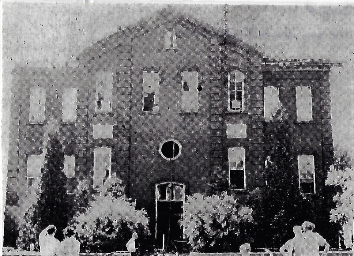
The grade school is shown as it appeared after the fire was put out.