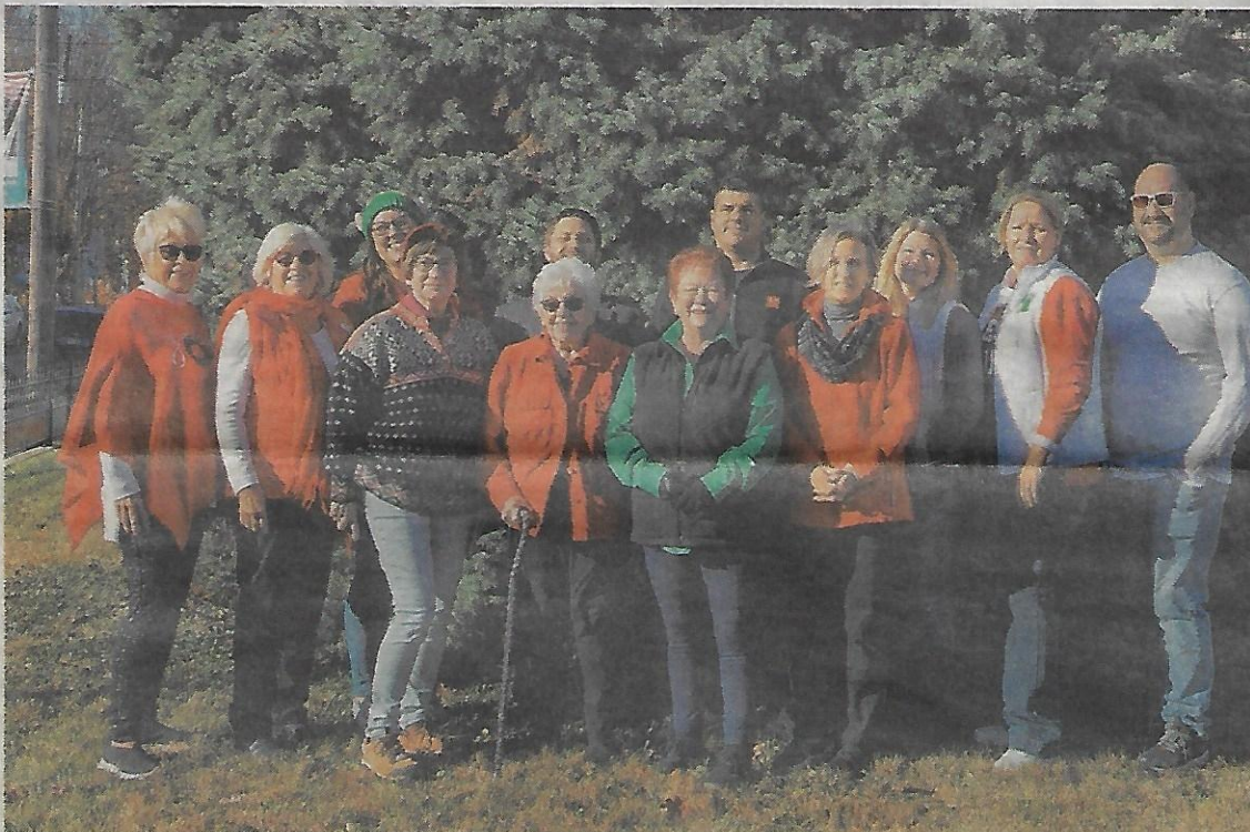
Members of the Winterfest committee and a representative from event major sponsor Members 1st

Winterfest will also host a food court set up on Delta Street with overflow onto East Main Street. Participants will include Blue Stone Bakery, Bube's Brewery,